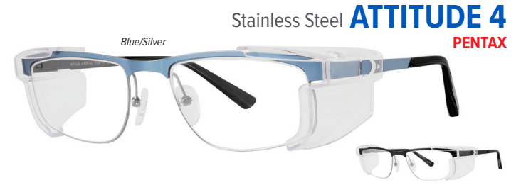
Stainless Steel ATTITUDE 4 PENTAX

Grooved Lenses REQUIRED Phoenix, Trivex & Poly Lenses ONLY