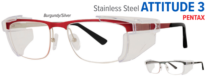
Stainless Steel ATTITUDE 3 PENTAX

Size 52-18-135 | 54-18-140 Color Moss/Dark Gunmetal | Burgundy/Silver Temple Spring Hinge Side Shields Standard