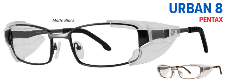
URBAN 8 PENTAX

Size 55-18-140 Color Matte Black | Brown Temple Spring Hinge Side Shields Standard