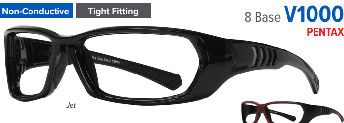
Non-Conductive Tight Fitting