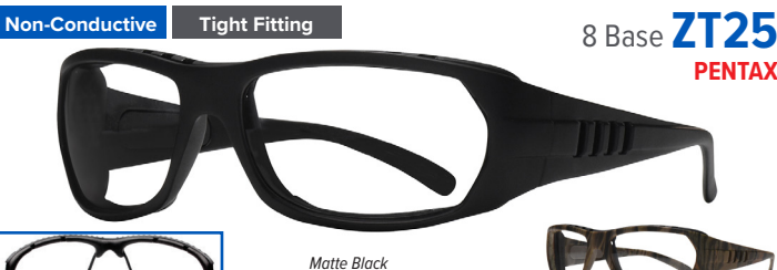
Non-Conductive Tight Fitting