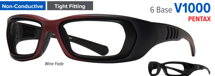
Non-Conductive Tight Fitting