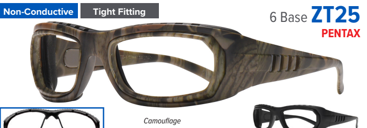
Non-Conductive Tight Fitting

Rx limitations: -4.00 to +4.00 total power including a -3.00 cylinder Phoenix, Trivex & Poly Lenses ONLY