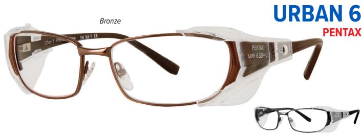
URBAN 6 PENTAX

Size 57-16-140 Color Black | Bronze Temple Spring Hinge Side Shields Standard